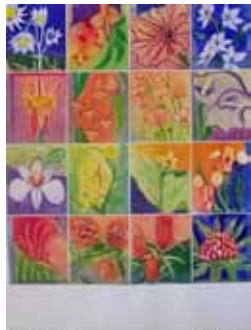
"Floral Echoes" Collagraph